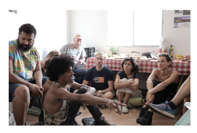
Figure 8. Chat during "Monday lunch" at the Neighborhood Museum.

To commemorate the ending of Lanchonete.org as an artistic project in 2018, an open class on 'local power' in partnership with Escola da Cidade was offered in the Neighborhood Museum. The class became a place to elaborate on different ways that we could bring, from the inside out, the community dynamics that had been developed throughout the project's entire process. This "turning outwards" could take form, for example, in the creation of a community garden. A community garden that will be used in the long-term as a common space on the ground floor of the complex, after the Museum and Lanchonete.org's term of artistic research comes to an end. The understanding (of the city) by the platform, its five-year duration, as well as its practical, activity-based production approach - creativity workshops, nutrition and food programming, communication and alternative media focus - are all conscious gestures of exchange, openness and seriousness, and indeed borrow from various community organizing methodolo-