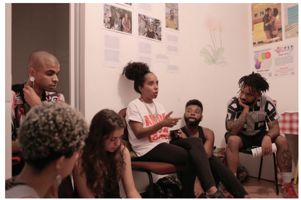
Figure 7. The groups Loka de Efavirenz and Coletivo Amem during a roundtable discussion at the Neighborhood Museum.

ternational programming on the Right to the City. Contemplating the idea of the right to housing in the center of São Paulo, the project developed, during the year of 2017, a series of events and debates that experimented new ways of using the existent space, in all of its constrictions. Conceived alongside the Philadelphia-based, Amber Art & Design collective, the "Neighborhood Museum" was developed in one of the apartments situated in the building Demoiselle of the complex. In it, weekly community lunches, workshops, roundtables, and other events, all served as moments to unite residents, curious visitors, and partners (activists, artists, architects, etc), fostering joint discussions about what it is that composes this right to the center of São Paulo.