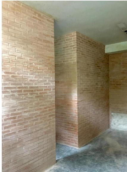
Figure 4 – Wall built with compressed-earth blocks, produced at the Occupation ‘Solano Trindade’, Movimento Nacional de Luta pela Moradia (MNLN), Duque de Caxias, RJ.