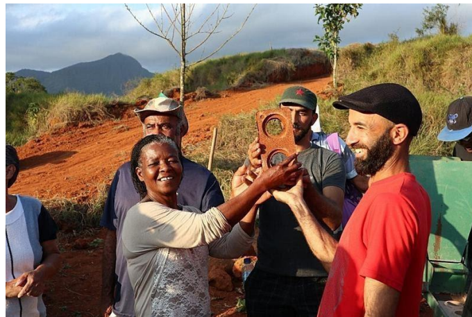
Figure 5 – Residents exhibit compressed-earth block, produced at the Sustainable Development Project, Movimento dos Trabalhadores sem Terra (MST), Macaé, RJ. Source: Brasil de Fato. Available at: https://www.brasildefato.com.br/2021/01/28/bioconstrucao-conheca-um-dos-dialogos-entre-agroecologia-e-reforma-agraria-popular