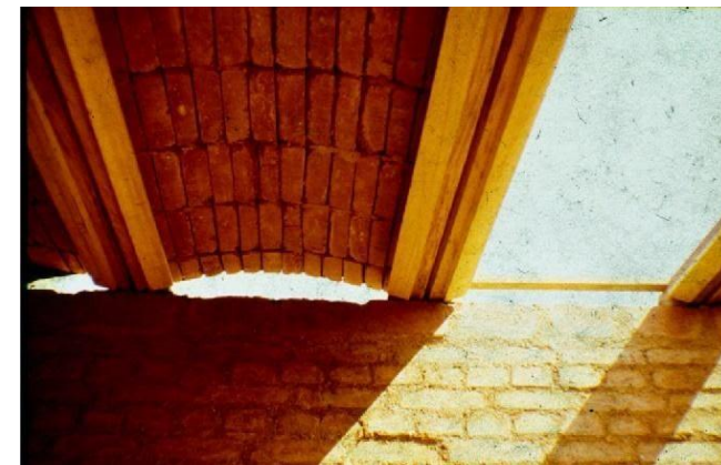
Figure 2 – Assembly of the vaults.